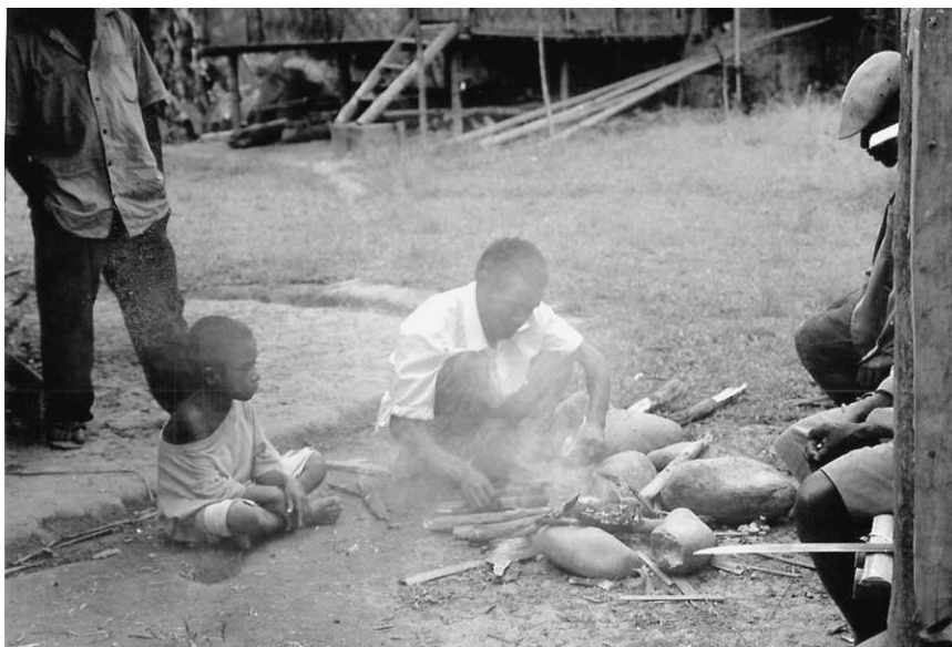
Fig. 3. Gold amalgam roasting near Watut River, Morobe Province, PNG.

related to the use of mercury—contained in Department of Mining Outreach Program records: