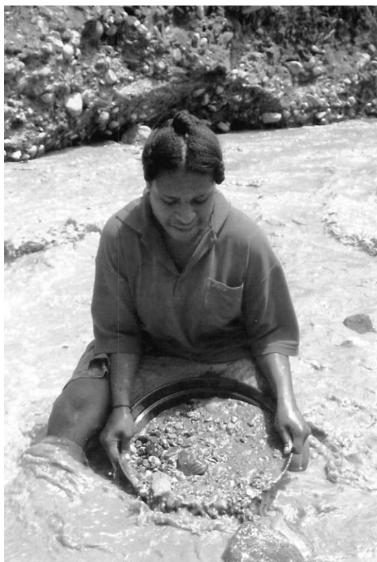
Fig. 2. Woman panning in Koranga Creek, Morobe Province.

ance and commit personnel to address a number of issues in PNG small-scale mining communities. Its initiatives aim to enhance environmental awareness, and in some cases, attempt to measure what effects both current and past mining activities may have on present communities.