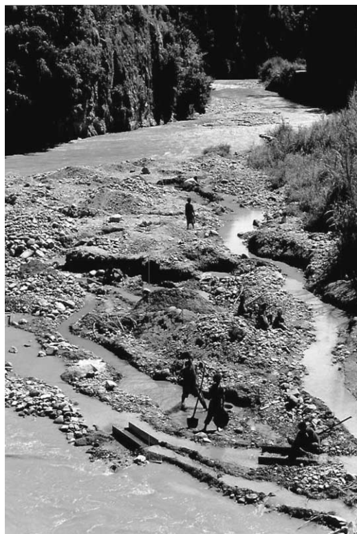
Fig. 1. Typical small-scale mining activity in PNG; location—Bulolo River, 2nd Bridge, Morobe Province.