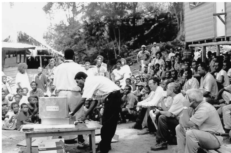
Fig. 5. Outreach Program using the solar powered VCD system, at Maus Bokis, Morobe Province.